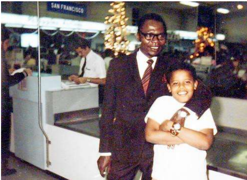
His father's only visit while Obama was in Hawaii